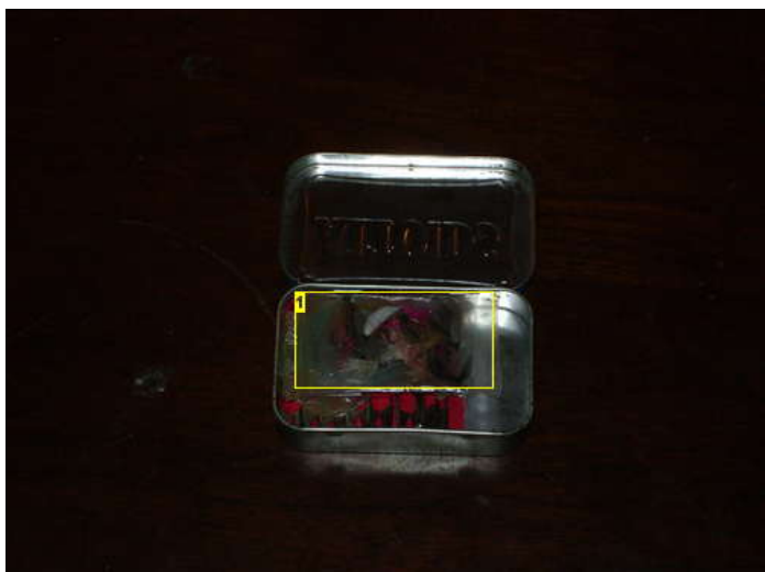
Image Notes 1. Assortment of Flies