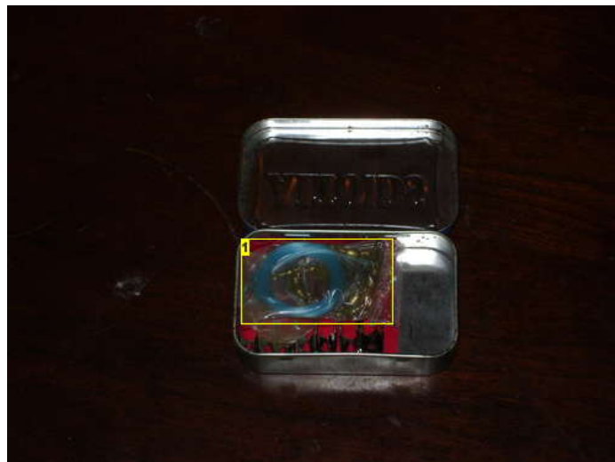
Image Notes 1. Steel/Mono-Filament Leader Lines With Attached Snap Swivels